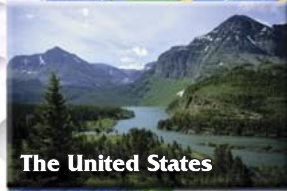
The United States

Aloe Vera has been used for many years because of the powerful nutritional benefits it provides. It is packed with valuable vitamins and minerals and other needed antioxidants. We use only the best, organically-grown, cold-processed, whole leaf aloe vera.